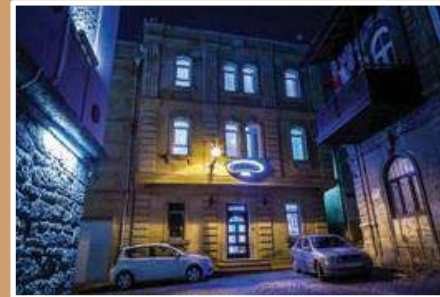
Premier Heritage Hotel, Old Baku City, Azerbaijan