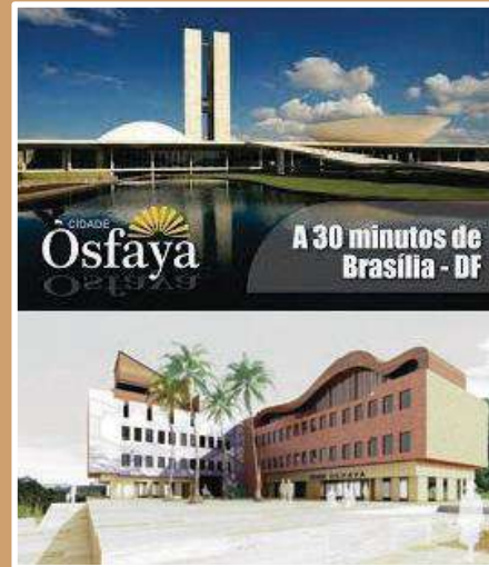
Osfaya Group in Brasilia City, Brazil