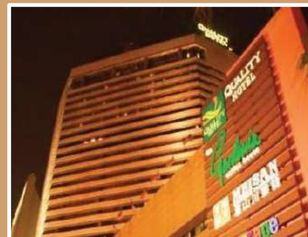
Quality Hotel Shah Alam, Malaysia